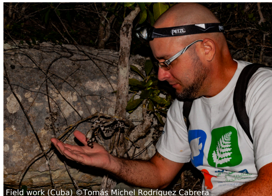
Field work (Cuba)

At the end of the year, the endowment was managed by Goldman Sachs, Banque Pictet, Oaktree Capital (Private Debt) and PGIM (Real Estate).