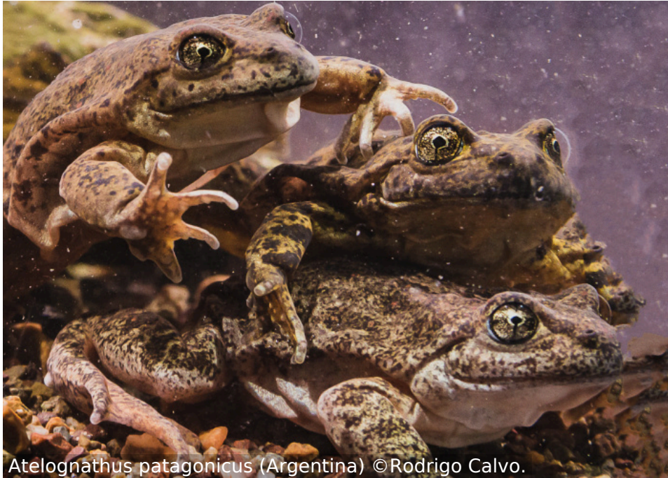
Atelognathus patagonicus (Argentina) ©Rodrigo Calvo.