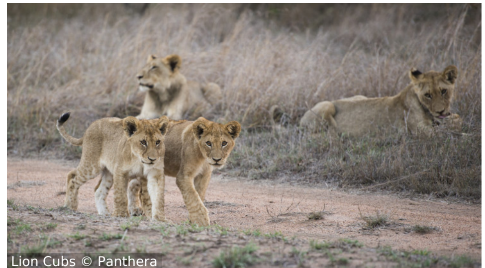
Lion Cubs

In southern Africa, Panthera has made great progress in reducing intensive poaching of Cheetahs, Leopards, Lions and their prey in Kafue National Park, Zambia, and Limpopo National Park, Mozambique. Panthera also supports anti-poaching efforts in Gabon's Batéké Plateau National Park.