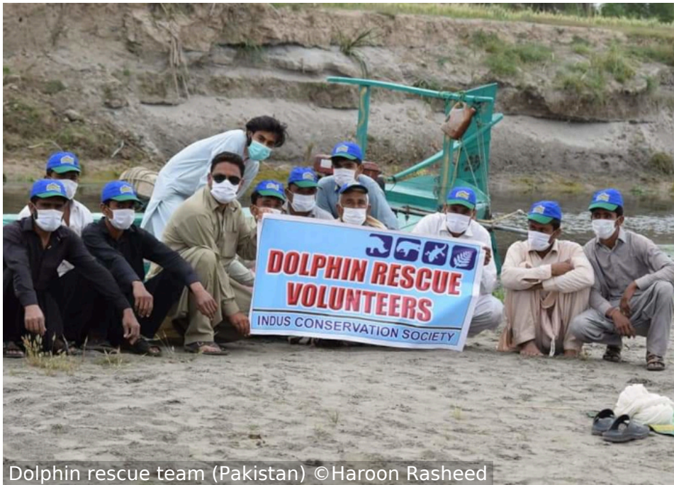
Dolphin rescue team (Pakistan)