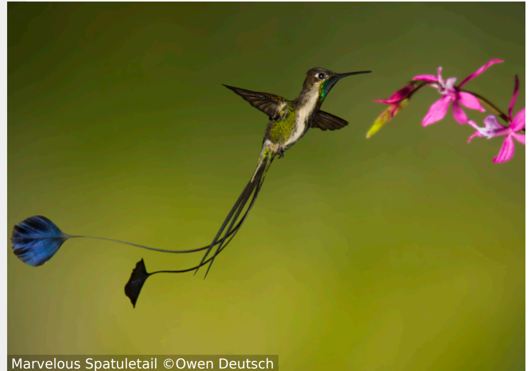
Marvelous Spatuletail